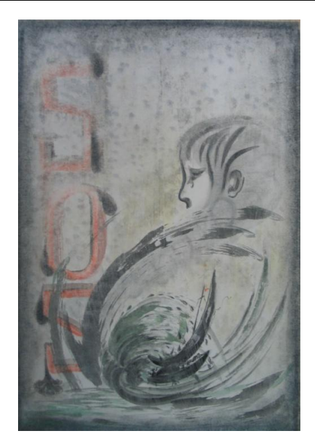
Fig 10 S.O.S.