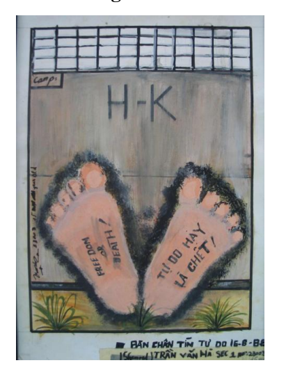
Fig 2 Feet to Freedom