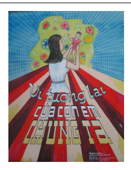
Fig 16 For the Future of Our Children