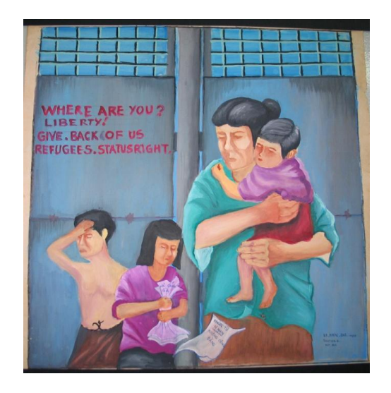
Fig 4 Where are you Liberty?