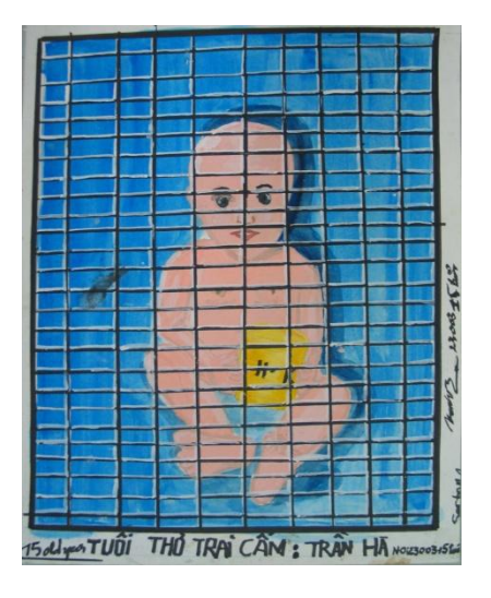
Fig 6 Baby behind the Bars