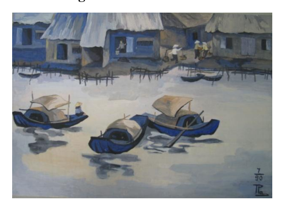
Fig 14 Fishing Village