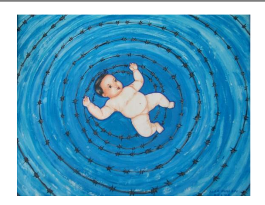
Fig 7 Baby Caught in Wires