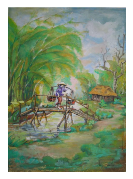
Fig 14 A Village