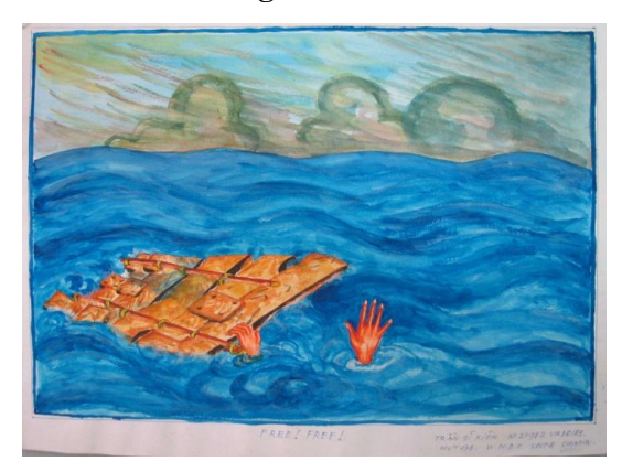
Fig 11 Free Free