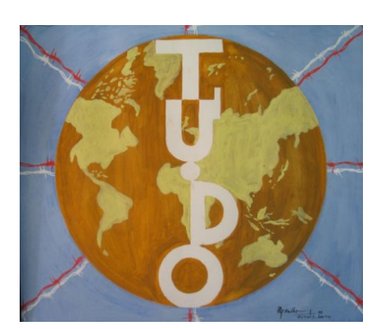
Fig 1 Tudo