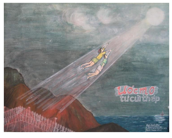
Fig 18 The Dream From Inside of the Cage