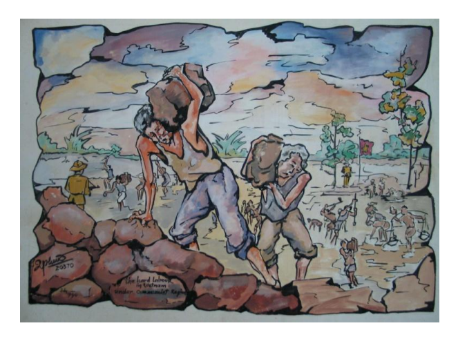
Fig 8 Like Hard Labour in Vietnam under Communist Regime