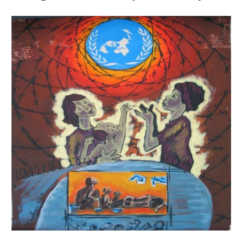
Fig 5 Hopelessness