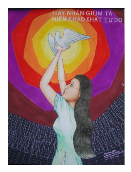
Fig 17 Convey My Wish for Freedom