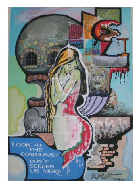
Fig 9 Look at the Communist, Don't Screen Us More