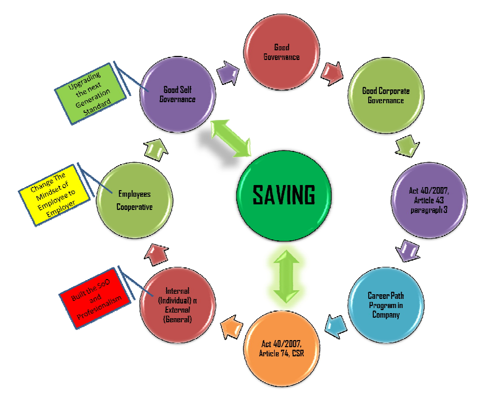
Fig.2: The Domino Effect of the GC (Good Governance) - GCG (Good Corporate Governance) - GSG (Good Self Governance)