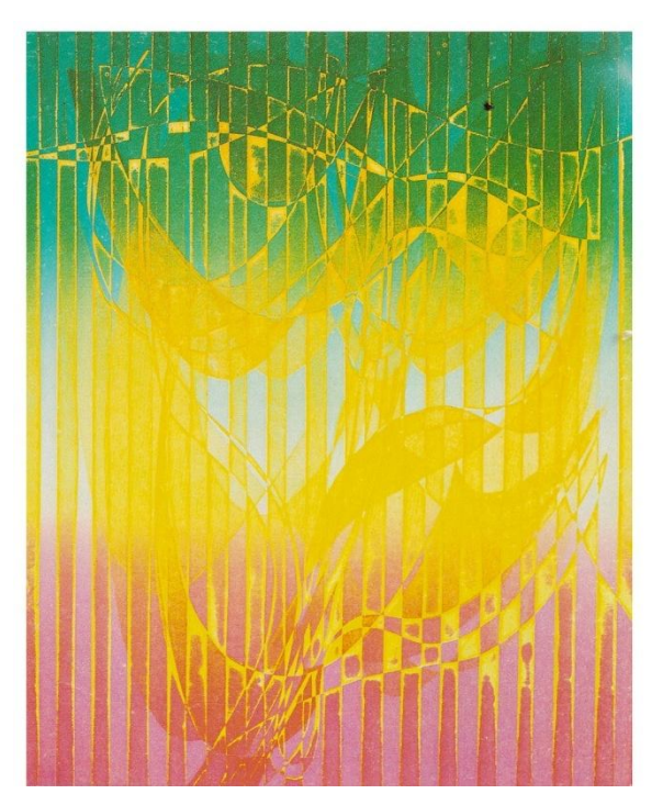
Image 3: Stanley William Hayter, 'Bouleau', Example of various color simultaneously printing, 1976 (Hayter, 1981, p. 145).

Image 2: Stanley William Hayter, 'Cascade' drain and multiply color painting on one plate, 1959 (Hayter, 1975, p. 139)