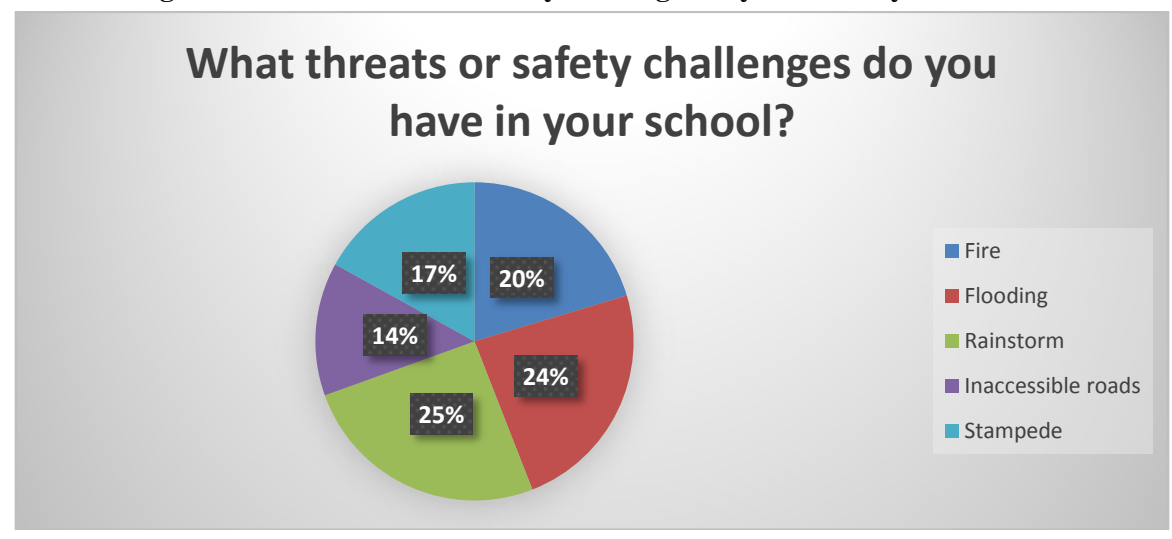
Figure 3.0: What threats or safety challenges do you have in your school?

In figure 2.0 seven (7) respondents from a total sample of sixty (60) teachers and head teachers representing 12% said they have received some training in school safety, while fifty-three (53) participants representing 88% claimed they have never received any training in school safety.