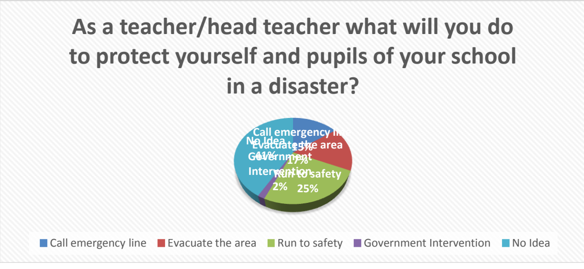
Figure 4.0: As a teacher/head teacher what will you do to protect yourself and pupils of your school in a disaster?

In figure 3.0 twelve (12) respondents from a total sample of sixty (60) teachers and head teachers representing 20% mentioned fire as a threat to their school, fourteen (14) respondents representing 24% said flood, fifteen (15) respondents representing 25% said rainstorm, eight (8) representing 14% said inaccessible roads and ten (10) respondents representing 17% believed that possible stampede was a threat to their schools.