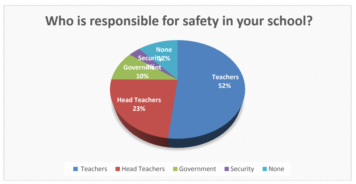
Figure 1.0: Who is responsible for safety in your school?