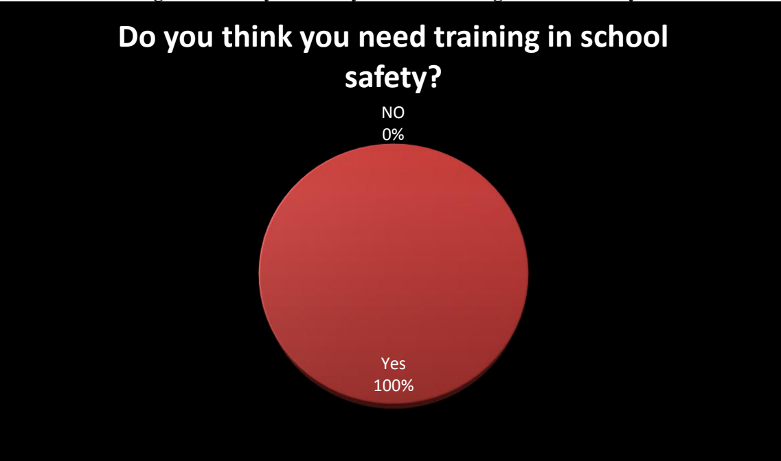
Figure 5.0: Do you think you need training in school safety?