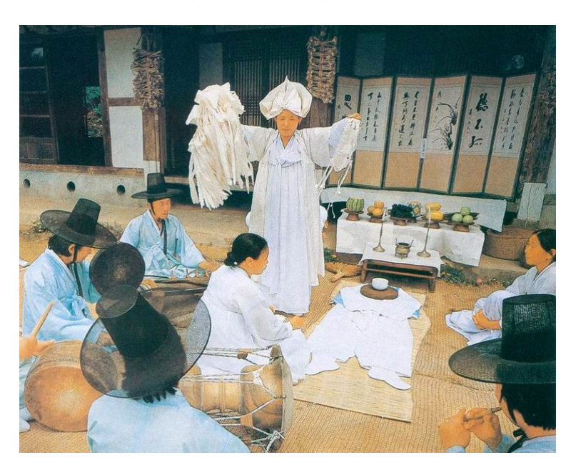
Figure 1. Dancing with Ko

1) For the goddess of the underworld, Paridegi-goddess has been believed to lead the recently deceased into the underworld. 2) After the calling of Paridegi, Mudang, as a medium, narrates how the deceased, the patients and the lost in the sea suffer from hardships. 3) Mudang dances holding Ko, a white knobbed lengthy cotton and hemp-clothes, which symbolizes the bruised wounds in the heart of the dead. Ko signifies the lonely and toilsome road toward the underworld. 4) Mudang cuts off Ko to transform it into small pieces, which are later used as underworld currency. 5) Mudang dances with a sham, a miniature ship for the dead toward the underworld. With this dancing, Mudang and some participants usually go into a semi-trance by encountering the ghosts and the timeless space. Dancing with Ko aims to purify and heal the traumas and suffering. (Fig.1)