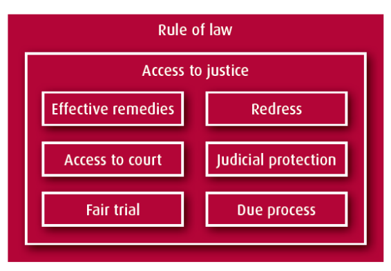
Figure 1: Access to justice and related terminology

Figure 1 offers a schematic overview of the terminology used in EU law which reflects the common understanding of the concept. 10