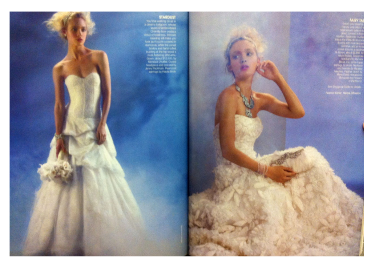
Figure 4: Bridal Guide, November/December 2010