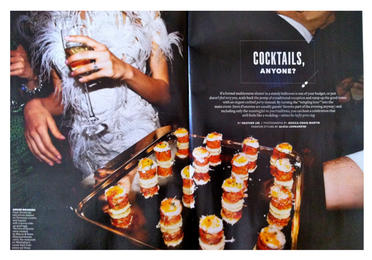
Figure 6: Brides, May 2012