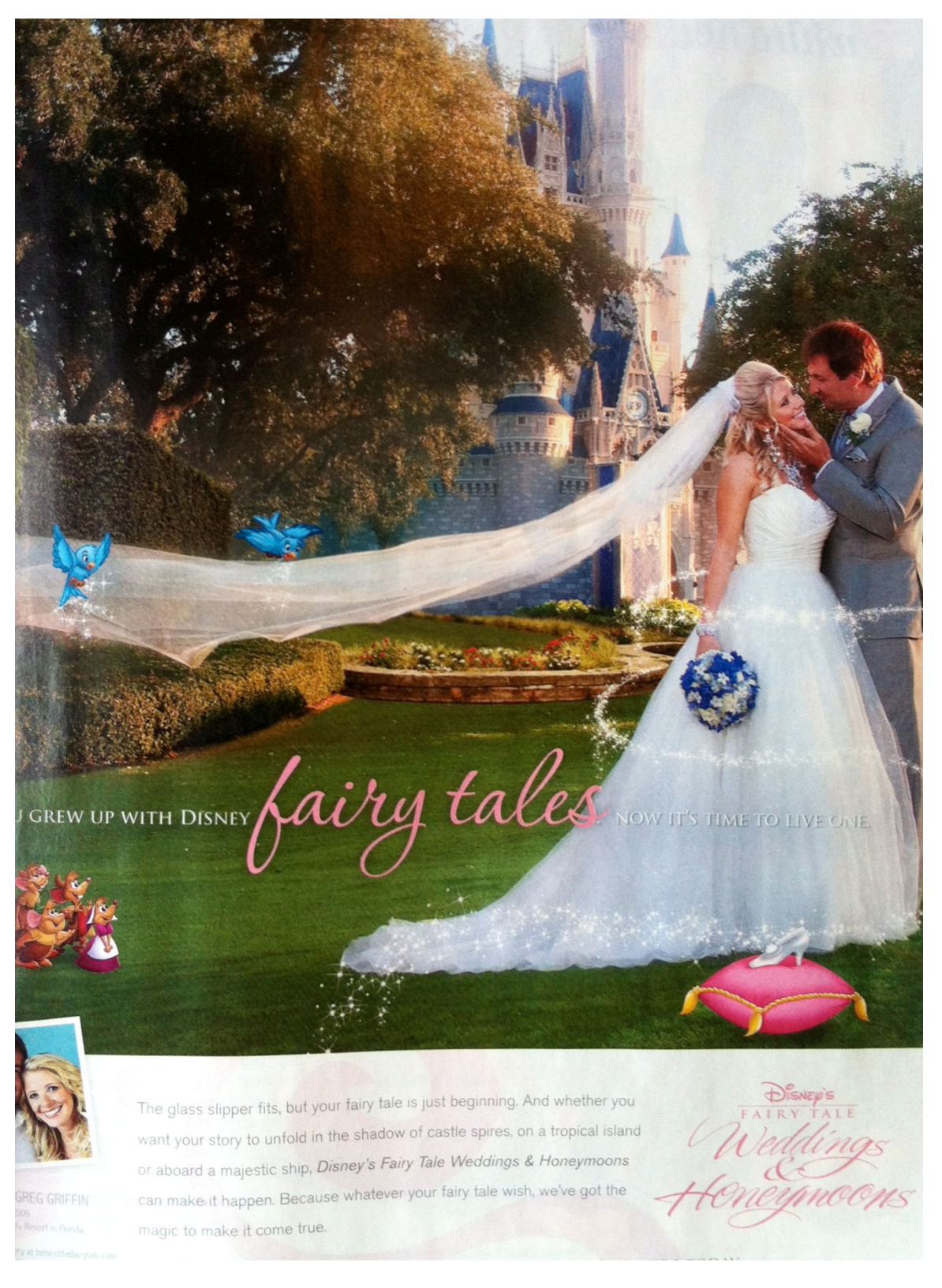
Figure 5: Brides, March 2012