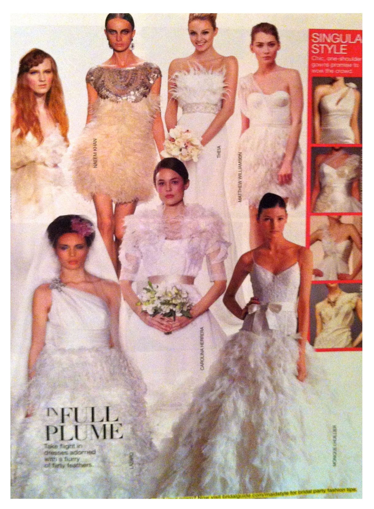
Figure 7: Bridal Guide, November/December 2011