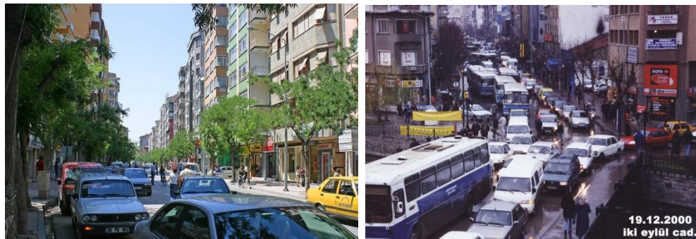
Pictures 14-15 : İsmet İnönü Street

The city’s traffic became very complex due to the increasing population.Addition to the buses,shared taxis and individual automobiles,Eskişehir needed environment-friendly vehicles with more capacity.Büyükerşen found the solution as the Tram but there was a serious obstacle.What would be the money source for it? Then,he prepared a project which contains three solutions for three problems.First is to reduce the risk of earthquake for Eskişehir which is in a earthquake area,second is for the city’s transportation:local transportation and the third one is for the fresh water:fresh water projects.He presented these projects to Europe and got the credits of European Investment Bank,North Scandinavian Countries Investment Bank and AMB Ambro Bank.