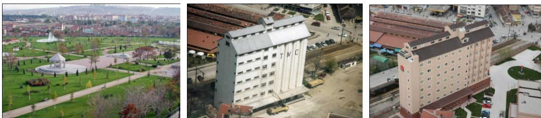
Pictures 21-22-23: Monument Park-İbis Hotel (Metropolitan municipality resources)

The city cemetery was moved from city centre and in this area of 132.000 m 2 Giant Monument Park was completed in 2002. One of the major projects of the State was the transformation of the Historical Silo Building into a hotel which were bought from Soil Products Office. The building which was in idle state was turned into a hotel, it was rented by a famous international hotel chain and with this project Eskişehir had a vital touristic bus. (Metropolitan municipality resources)