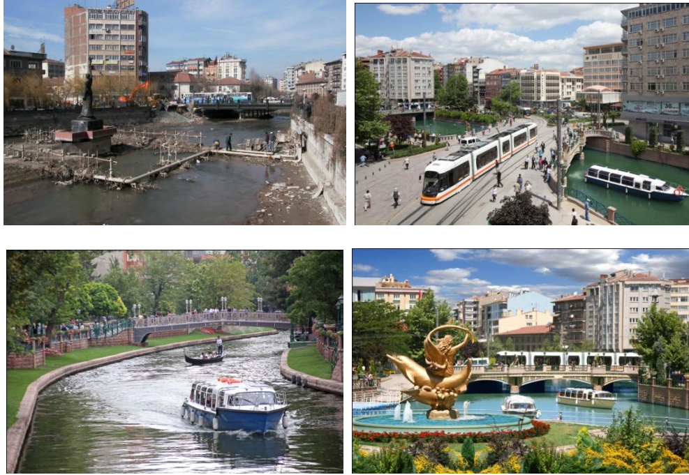
Pictures 10-11-12-13 : The Porsuk Creek in the middle of the city

After the Organization for Security and Co-operation in Europe report saying “It is a swamp whose ground is full of waste without any alive creatures except harmful bacterium and virus”,the creek was going to be empowered with canals and floodgates against floods and earthquakes.With a project covering an area of 13 kilometers,the creek was cleaned and empowered against these natural disasters.Also,they made a great landscaping to the both sides of it.All of the old and weak vehicles and bridges on Porsuk were both strengthened and modernized.Porsuk project has been unique in Turkey not only by cleaning a river but also by giving it new functions such as sports activities,transportation.To benefit from Porsuk in city transportation,a shipyard was established in Eskişehir,a city without a sea,and the production of Venice type Gondolas were started to supply the need of Gondola of the other cities addition to Porsuk creek.Now,Porsuk creek serves touristic tours like Amsterdam and Strasbourg and it is a good alternative for city’s transportation.On the renewed Porsuk creek,national and international aquatic sports organizations are held,on the floating platforms several concerts are given.