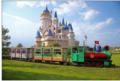
Pictures 24-25 : Sazove science-culture-art Park (Metropolitan municipality resoures))

Sazova which was empty and lack of greenery was made a science-culture-art park in an area of 400.000 m 2 .In this park,there are a pool for water sports,restaurants,amphitheatre with a capacity of 1200 people,pirate ship,game groups composed of fable characters,game area for handicapped children,experiment centre including a observatory in it and fable castle which is first in Turkey.Again,an area of 270.000 m 2 was turned into Kent Park in which there are a beach of 350 meters length and places to rest,eat,swim.