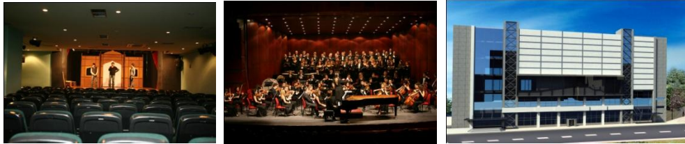
Pictures 18-19-20 : Turgut Özakman Stage-Culture Palace-Convention Centre

Addition to the structural solutions, Büyükerşen prepared cultural projects for Eskişehir. First of them was the City Theatre, second one was the State Symphony Orchestra (January 25 th of 2002), third one was Turgut Özakman Stage (April 12 th of 2002), fourth was the Culture Palace in which there are opera, ballet, theatre, exhibition halls. Fifth one is the ongoing building, Convention Centre in which there are convention centre with 1300 people capacity, art gallery and three-storeyed parking lot. It is planned to finish the centre before the spring of 2012.