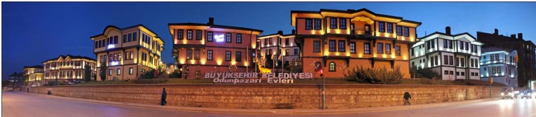
Picture 6 : Restored Odunpazarı Houses

The liver in Odunpazarı lasted longer so the first residential area of Eskişehir was Odunpazarı. Because of the fire in 1905, the little businesses of Eskişehir moved to Odunpazarı and the area also remembered as the names of the handiworks practiced there. The city has come today by protecting the Ottoman civilian structure and traditions such as twisted roads, dead-end streets, bay-windowed wooden houses. Odunpazarı houses are structured in two types. The first types have a garden at the back and they are entered from the street. The second types have a garden at the front, the houses are in the garden and they are built as single-storey, duplex or triplex. Generally, houses have a sofa and several rooms around it. If they are duplex or triplex, kitchen and storage are in the basement and they live at the top floor. At the two sides of the houses, the corner rooms with windows are so important.