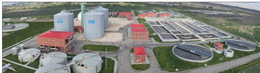
Picture 30: Wastewater Treatment Plant (Metropolitan municipality resoures )