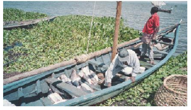
Plate 6: Water hyacinth causes problems in many regions

Although water hyacinth continues to cause serious disruptions in the use of water bodies in Kenya, the government has not promptly moved to contain the spread of this weed. In view of this, this paper identifies the weaknesses related to access of information on water hyacinth, implementation of control mechanisms, and lack of research on certain aspects as the gaps that explain why Kenya is not swiftly taking measures to control water hyacinth whenever it invades its water systems. These gaps call for action to effectively mobilize, organize, and equip decision-makers, researchers, and representatives of communities, along with their organizations and institutions, to improve their response to the water-hyacinth problem.