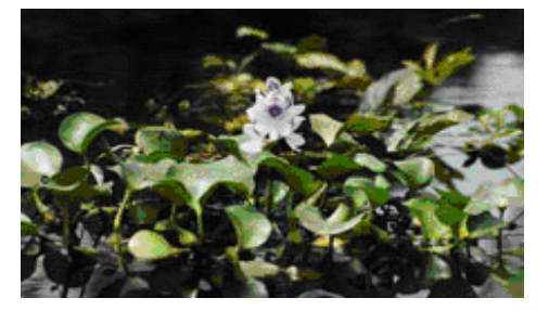
Plate 2: Water hyacinth leaves