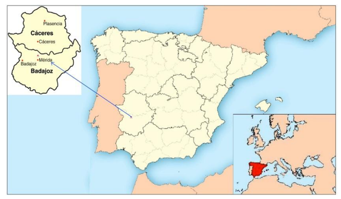
Figure 1. Location of study area

Proserpina reservoir is located five kilometers north of Merida, capital of the Autonomous Community of Extremadura, and south-west of Spain (Fig. 1).