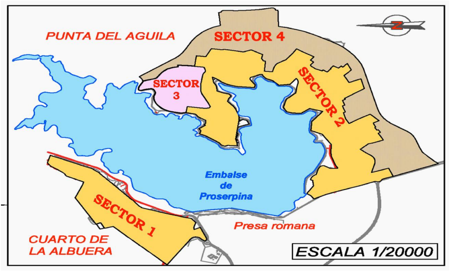
Figure 2. Sectors of the urbanized area

After all of the above, the mandatory technical and legal considerations in the implementation of any proposal to improve the situation have been examined.