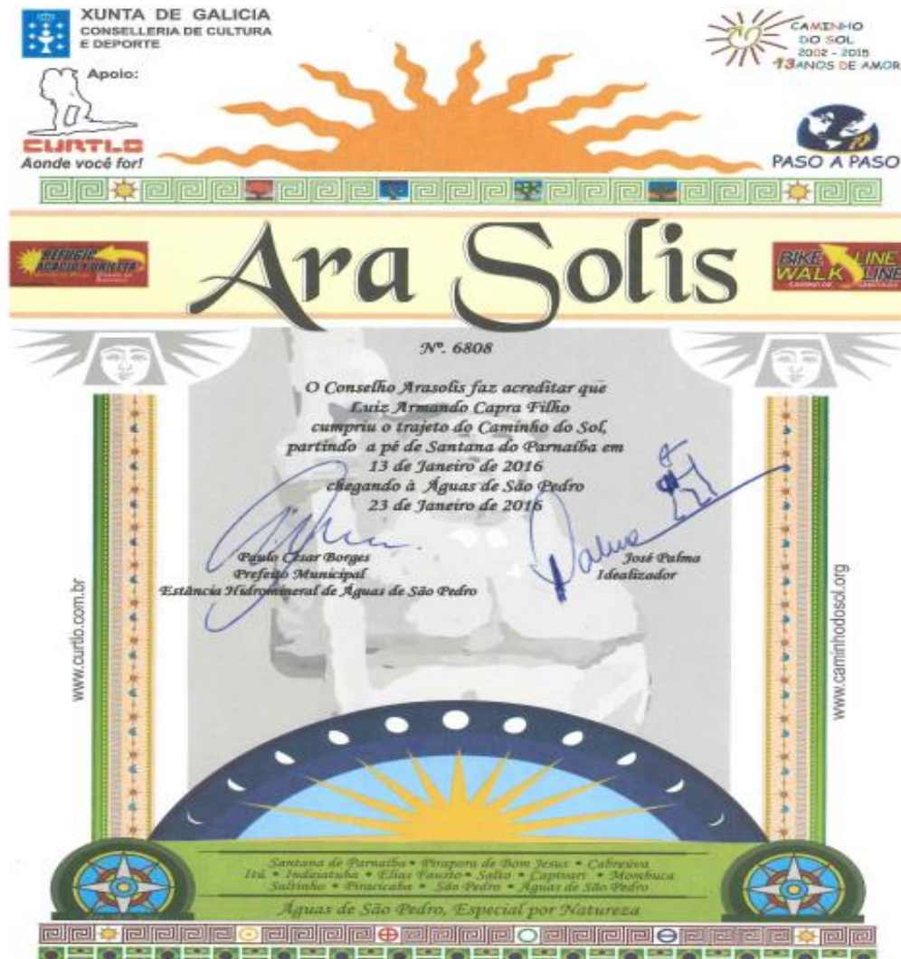
Figure 2 – ARA SOLIS – Path of the Sun Certificate of Completion